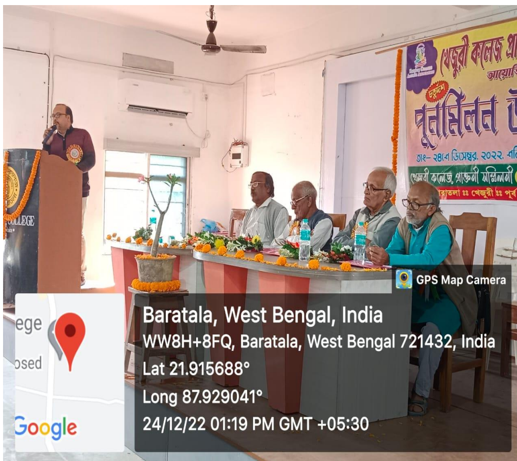
Reunion Programme by Alumni in Progress